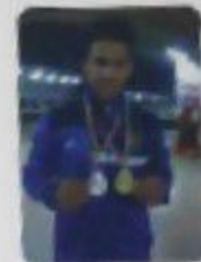
Judo Nishi C